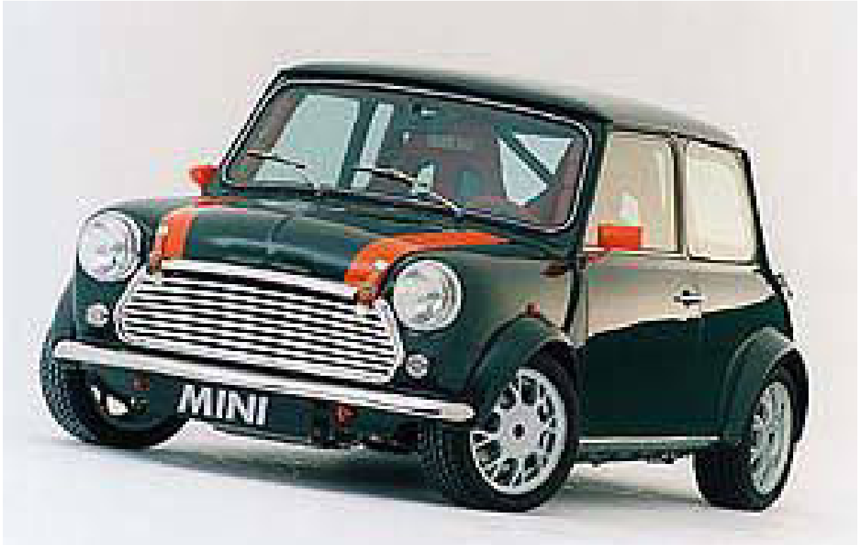
The Mini Hot Rod