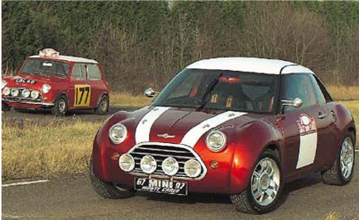
That was then...