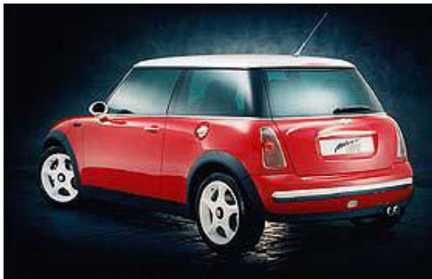
The New Mini ("Spiritual")...