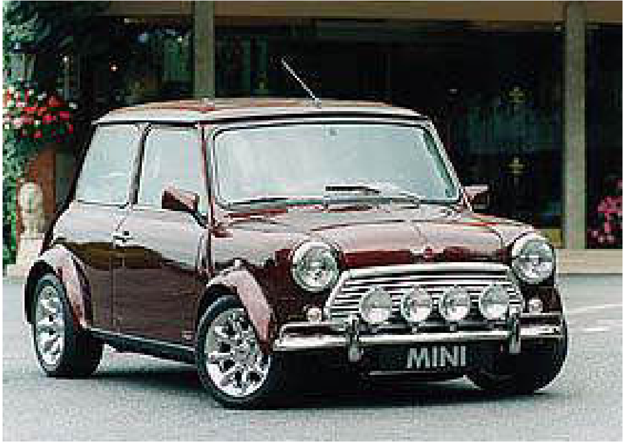
The Mini Limo