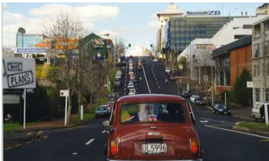
Traffic jam at Cook Street.