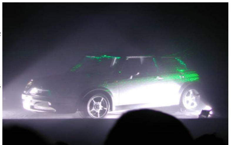
The new MINI

Enough was enough, so we set off home. Seems like lots of other people had decided the same, because there were serious traffic queues out of Silverstone. Bloomin' also developed a fuel leak from the fuel bowl - something to check out I suppose - so I ended up switching off the engine every time I had to stop and wait. Once on the A43 it was good going and I got home without incident.