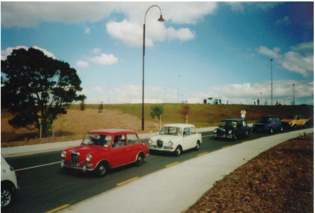
The Rileys colour tuned on the road. Looks really nice, Red White and Blue.

It would have been a good night's sleep if some silly pillock hadn't been running around at 4:30 in the morning shouting 'arse' at the top of his voice. He was wandering all over the campsite waking people up. If I'd had a baseball bat with me... Around 8:00 we were up, cooking breakfast. Luckily the sun was out, so the tents were drying nicely - I was