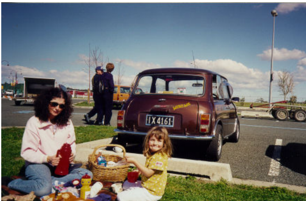
Relaxing at North Harbour Stadium

I must echo some disappointment - as has been mentioned before, the show was VERY children un-friendly - fortunately my two are that bit older, but I think they were still a bit disappointed by the lack of entertainment for *them*. My other BIG beef is with the Rover 'New Mini' feature display - SH!T. All they did was wave a few lasers over the