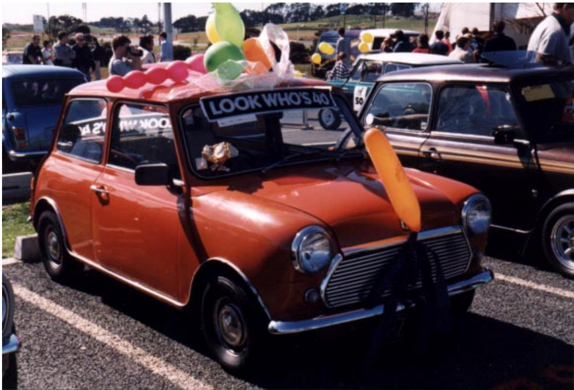
Forty years old and still looking stunning.

The Box with 4 wheels on the extreme corners and an E/W motor driving the front wheels is the choice of today.