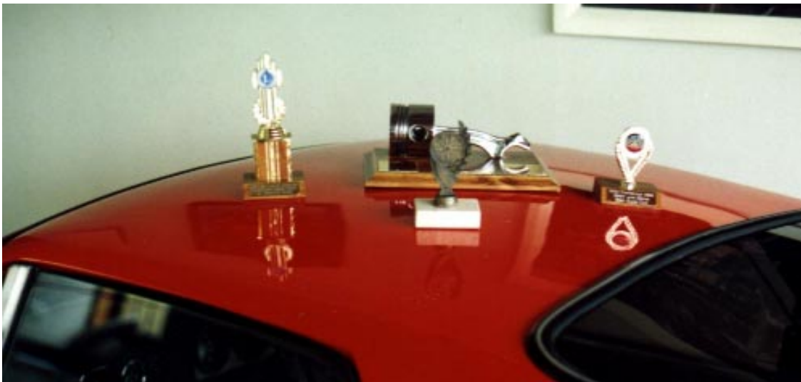
Looking smart on the roof.

Make sure vou attend March 7 th Clubnight for