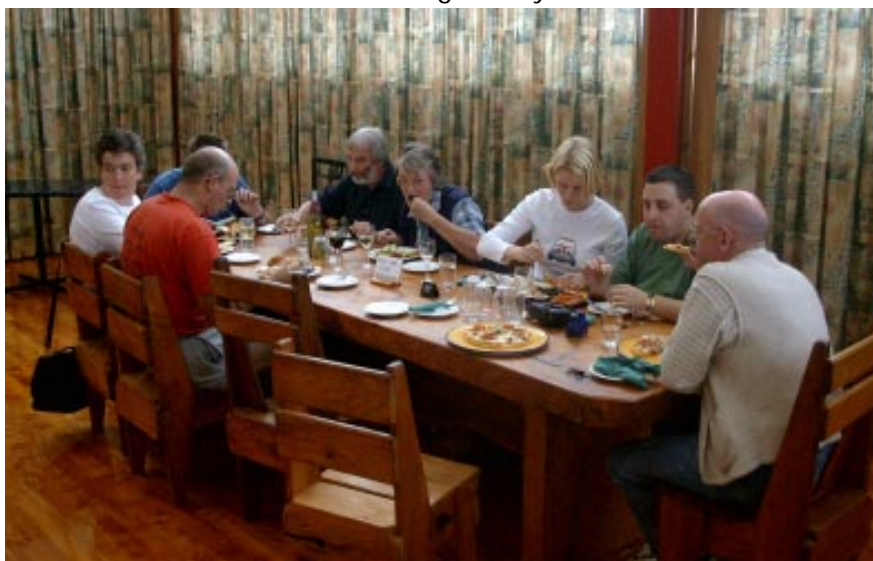
Table 1 at Cook's landing.