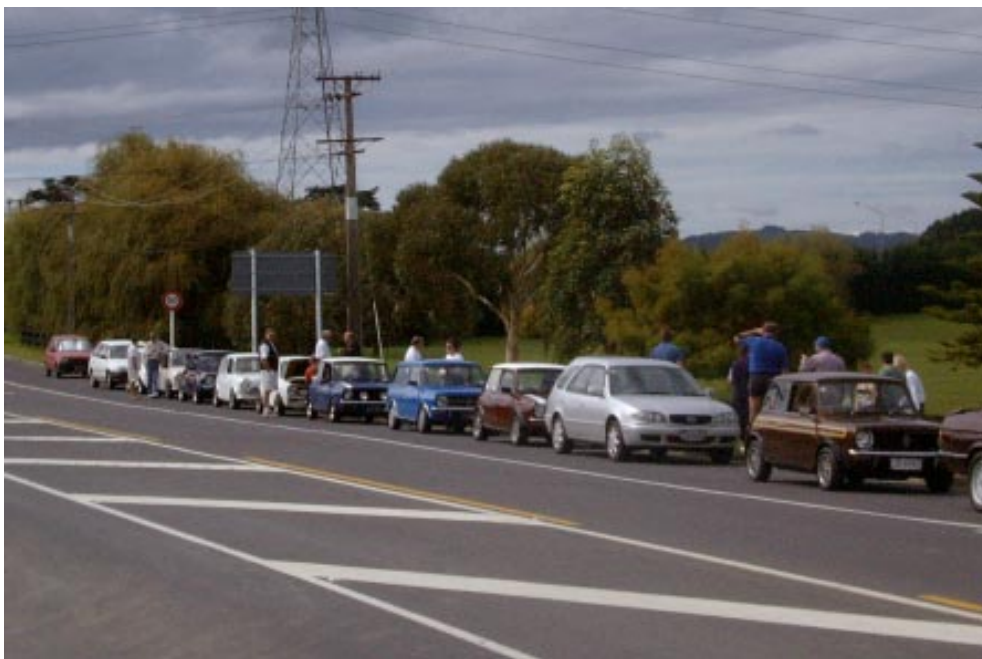
Line up just before the start of our Cooks Landing Run. Cook's Landing Run, Sunday April 14 th

Some of us can think of no better way to spend a Sunday than with our favourite small car, a tasty lunch with fine wine and cool jazz, so that's exactly what we planned for Sunday April 14 th .