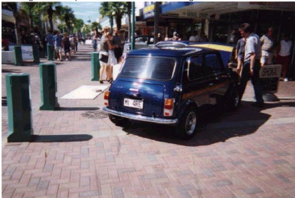
Main street of Napier. Guess who's Mini this is.

Tequila was set up entertaining the crowd, Starbear in his cuddly bear suit must have been hot it was a lovely sunny day. Starbear danced to the music and gave kids hugs and had photos taken with kids of all ages.