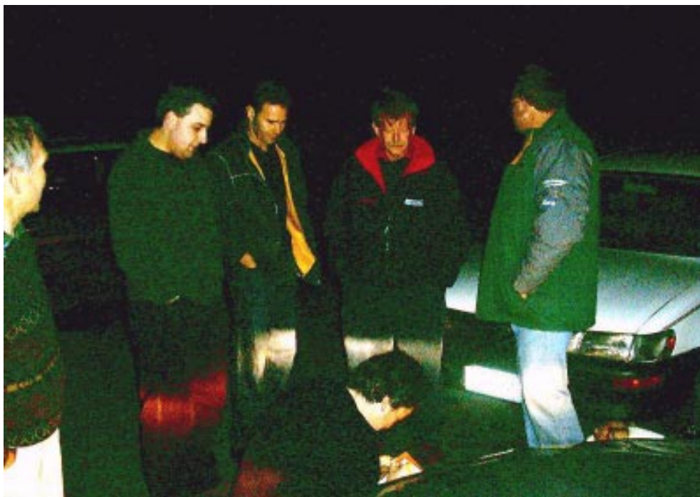
Working out the start by night is not an easy task.