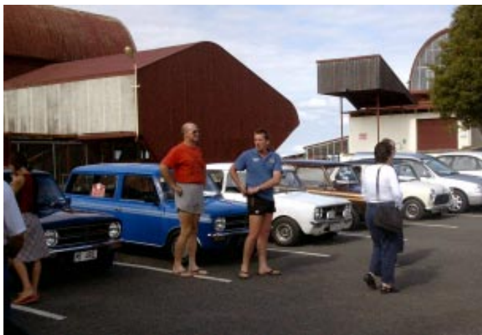
Outside Cooks Landing winery.

We will definitely have to repeat this trip, especially so that the designated drivers can have a turn at being passengers and thus experience the wonderful wine at Cook's Landing.