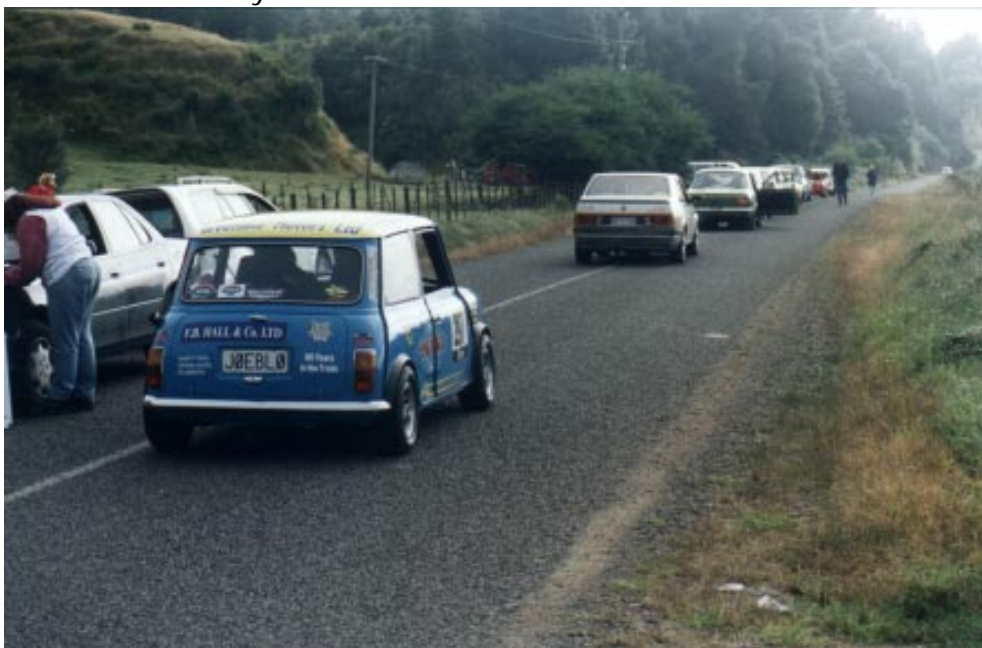
Targa racing Mini.