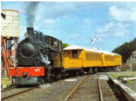
Ww 480 glides into Glenbrook

her over”. She was built at North British Loco works in Glasgow in the early 1940’s to a NZ design. The other engines are Ja 1250, ‘Dianna” (a South Island Express engine built at Hillside in 1949 and used sometimes for Mainline excursions), the “Mallett” (this engine, built in the USA and shipped to NZ in 1913 for the Taupo Totara Timber Co. is now the only example of it’s type left in the World) plus a few diesels. There are a couple of others waiting for restoration, an Ab and “F”233 built in England in 1886.