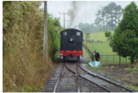
Swapping ends at Fernleigh

The engine on our train, Ww 480, was built in 1910 at Hillside as a Wg class locomotive. NZR at the time needed a new tank locomotive for light goods and passenger service. They had already built a very successful 2-6-4T tank engine designated Wf and developed it further by increasing the grate area, increased the weight (for traction), larger tanks, four-wheel front bogie making it a 4-6-4T and designated it as a Wg.