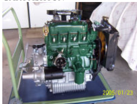
Gary's engine ready to rock.