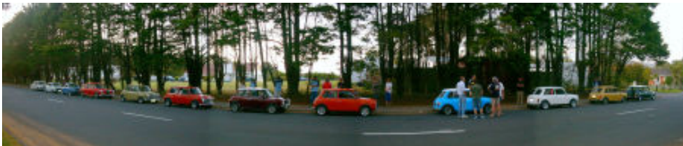
Dawn breaker run. All lined up for the start from Connought Road Green Bay.