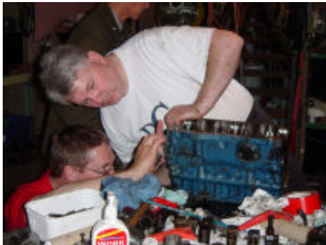
putting in the camshaft