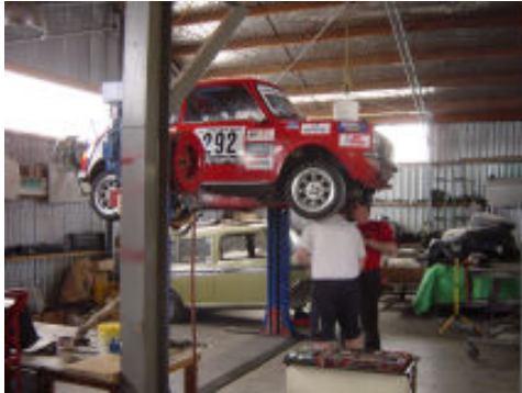
292 on the hoist