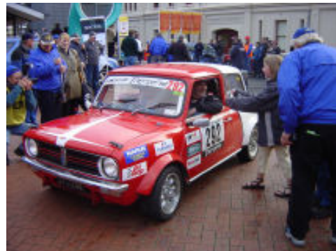
finish @ Queens wharf