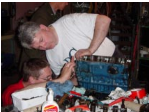
putting in the camshaft