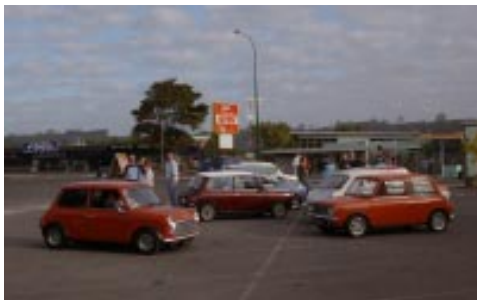
The first cars in.

I don't think we came last. Not too many cars went passed us. After about an hour and a halve we arrived at the finish at The Carriages in Huapai where we had breakfast. I under-