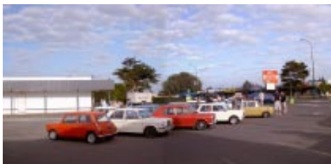
Just about everyone has arrived

stand that they opened early for us which was very nice of them. Inside it looked like a railway station with two carriages at the platform. The variety of chooise was very good. I had a healty breakfast with bacon and eggs while the