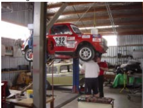
292 on the hoist