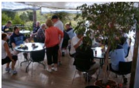
First the stories