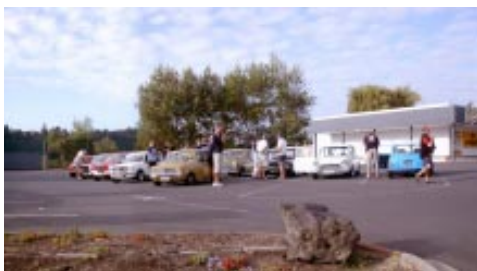
At the Carriages car park