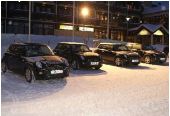
Next MINI model caught in cold snap

After taking a few photos from our end, the BMW members got a bit too fed up, and we were rather curtly accused of 'impoliteness'. At which point one of the gentlemen kindly let us know that he could be "auch unhöflich" [German meaning "also impolite" - a threat by BMW member]. Whether that was intended as a threat we will leave up to you, but the fact remains that the BMW folks are going to have a big problem of a non-technical nature: lots of curious journalist eyes, because the Volvo-happening with the XC90 V8 is lasting a whole month and we won't be the only ones showing an interest in the new MINI.