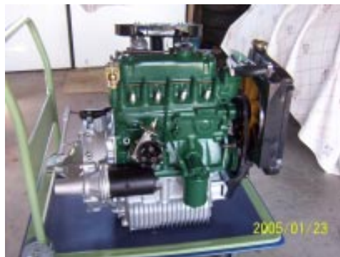
Gary's engine ready to rock.