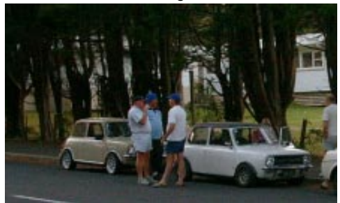
The Hamilton Group

Register your car and navigator and wait for the big moment when you get released. Before that, there is plenty of time to socialize with the other participants. This time there were 14 cars, I think, including two all the way from Hamilton. I suppose they took off a tad before 5am to reach the starting line on time.