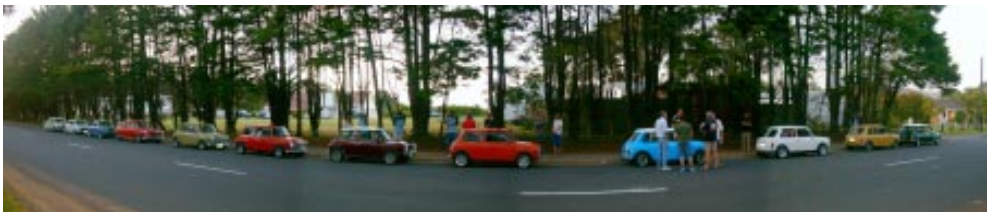
Dawn breaker run. All lined up for the start from Connought Road Green Bay.