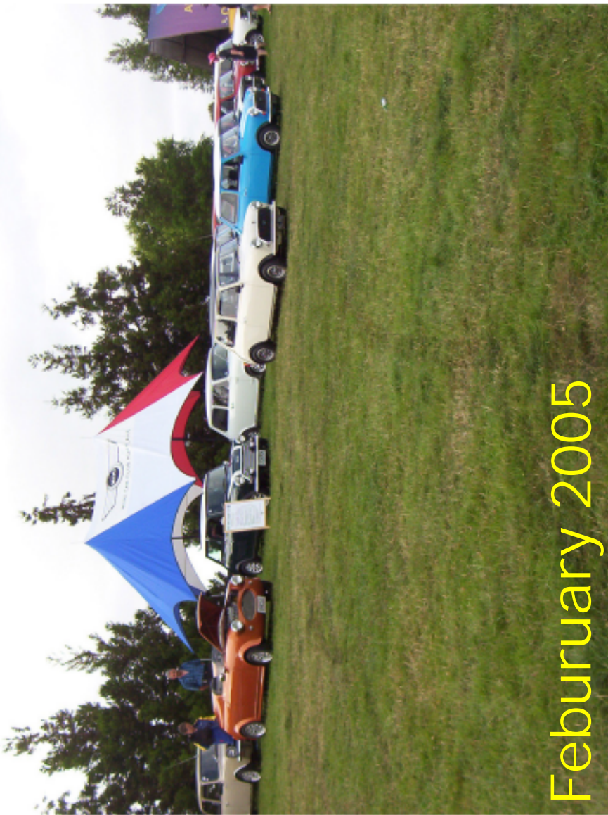
Our stand at the Classic Car and Hot Rod Festival, Kumeu.