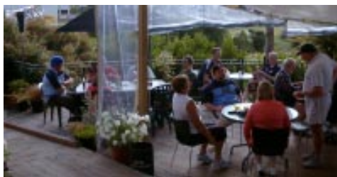
Then the refreshments