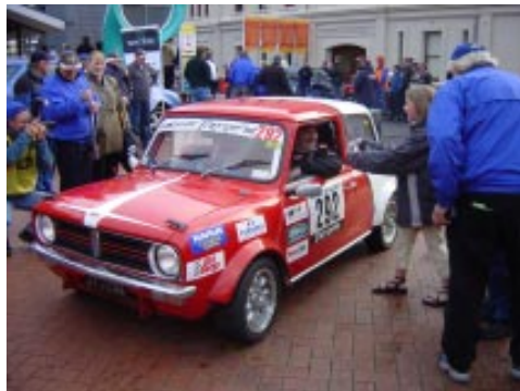
finish @ Queens wharf