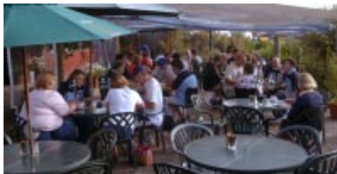
Then some breakfast

up with me to go to the Mini Nats in ChCh. This was yet one of those beautifull runs organized for you. The Carriages could have handeled easely another 30 people or so which would mean double the number of cars in the run! The next run coming up is the "Tour of the North" which is three days and will take you all the way to Kaitaia and the Bay of Islands. Better start planning for 5,6 and 7 March. Keep your ear to the ground at club night. Frits.