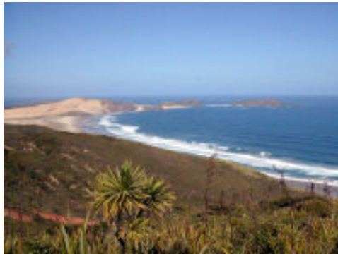
Near the Cape.

We celebrated Frits's birthday over dinner in the motel restaurant [ thank goodness a phone call from the wife reminded Frits that it was indeed his birthday !!!!] Early the following morning we headed for Cape Reinga , stopping for an ice-cream on the way. Breathtaking scenery as we neared the cape!