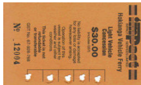
All five cars went on the one ticket. Really nice guy, that ferry master.