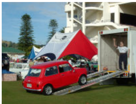
Getting into moving trucks.

Well our Club's stand looked great, and despite being on the outside edge of the display area it created a lot of attention and we had people coming to talk and looking all day. So let's take a walk around the rest of the show.