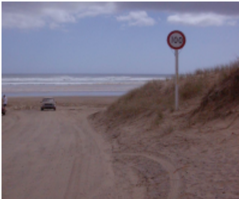
Ninty mile beach near Awanui

On the return trip we detoured down to the edge of ninety mile beach , where we stopped to view the wild west coast.