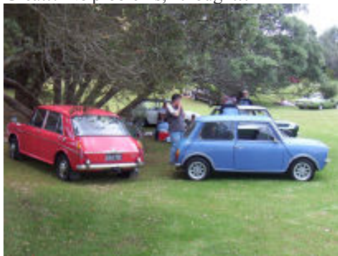
Mini Club cars at Awhitu Regional park after the Classic Run

Catherine and I picked up the Moke a couple of days before the show and put it in our garage. The day before the show, we loaded the tent and BBQ into the trailer ready for the early start on Sunday. On Sunday morning, Catherine was inside, finishing a few things, I got the Moke out of the garage to put the trailer on. That is when I found problem number one. The towball on Graham's Moke is a different size to the trailer.