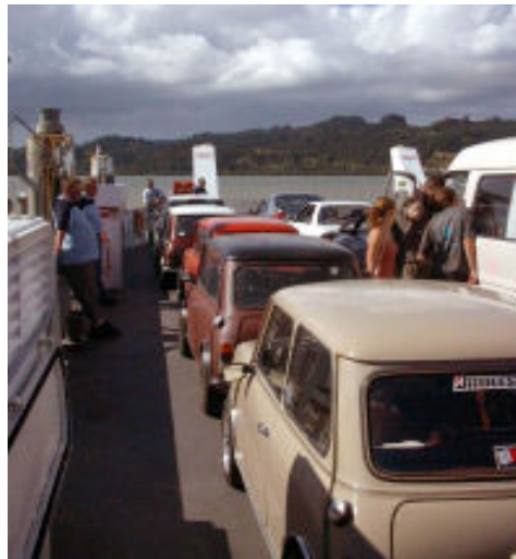
On the Ferry.