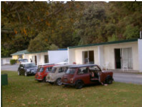
Opua Beachside Holiday Park.

On our trip down to Paihia we searched the coast for a cup of coffee [ much to Michael's disgust - he doesn't drink the stuff! ] Two broken coffee machines and one closed cafe later, we finally consumed a cup of real coffee at Coopers Beach. Needless to say , we all felt rejuvenated from here on. We travelled on to Paihia, settling for the night at Beachside Holiday Park. A large amount of liquor was consumed during the evening [ as some can testify to ], along with fish and chips