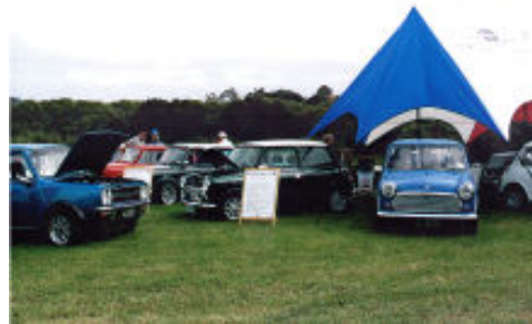
The Coopers among us.