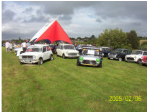
Our display at Motat, 30 cars in total.