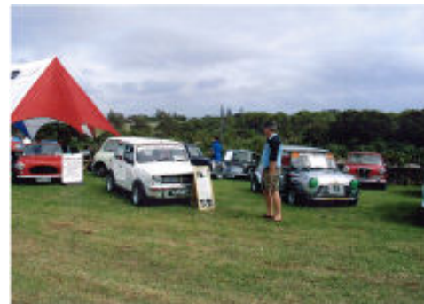
De Joux, Clubman and racer side by side.