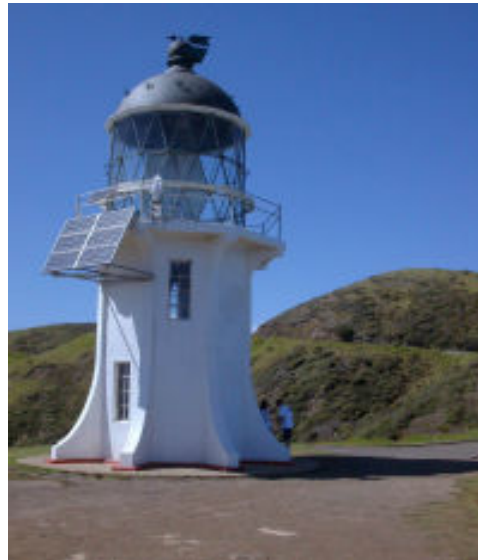
Cape Reinga light house