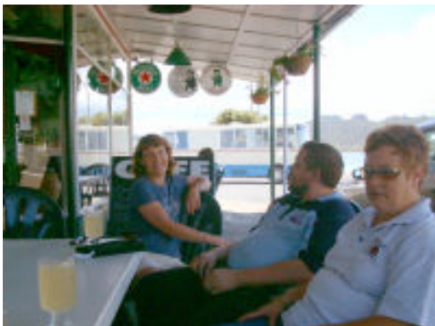
Having a drink and a meal.