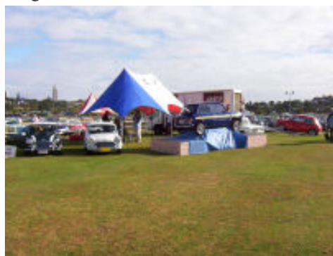
Club display at Ellerslie

No problems you think. Well, this was problem number three. Roxanne had been sitting outside in the wet, something she was not used too. Her battery was flat!! The word Bugger comes to mind about here!! Okay, so what's the next plan? We could take all the stuff out of Roxanne and put it in the Toyota, but we are both tired of turning up to classic car events in a Japa. There is only one thing to do, jump start Roxanne, no problems. Away we go.