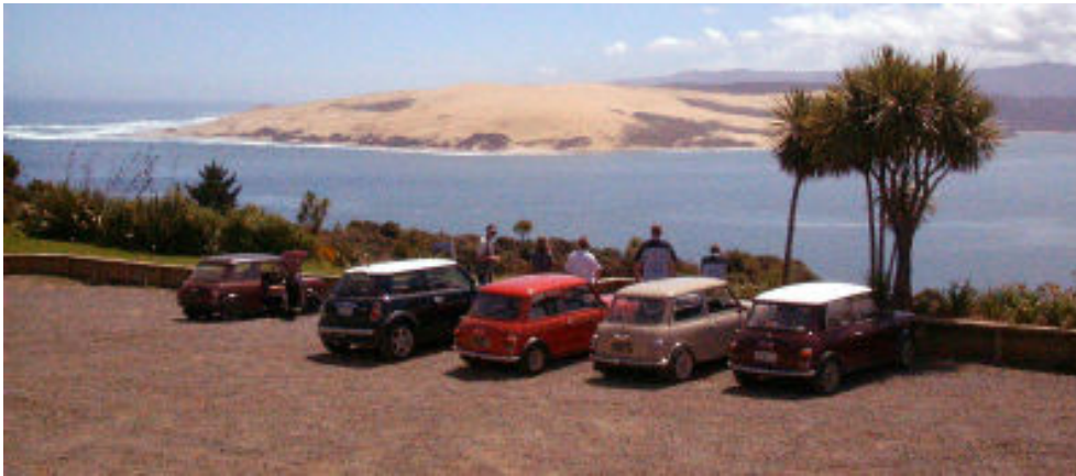
Gorgeous Hokianga harbour.

We stopped at the lookout over the golden sands of Hokianga Harbour, then on to Rawene for a leisurely 1 1/2 hour lunch outside overlooking the ferry terminal. We enjoyed a scrumptious feast while watching the ferry come and go.