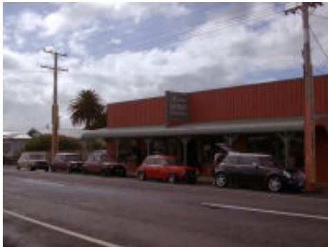
Ruawai coffee stop