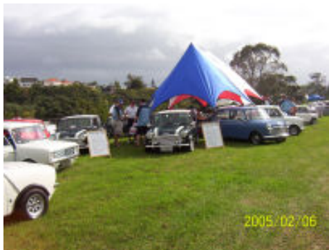
Another shot of our display.

With the tent up and cars in place, it was time to look around. The swap meet was buzzing all day and all manner of cars were on display from old Chevs, Model A Fords, VW, Vauxhalls, Morris 1000, Classic Midget cars and so on.