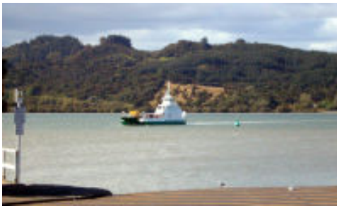
The ferry we saw coming and going.

We stopped at the lookout over the golden sands of Hokianga Harbour, then on to Rawene for a leisurely 1 1/2 hour lunch outside overlooking the ferry terminal. We enjoyed a scrumptious feast while watching the ferry come and go.