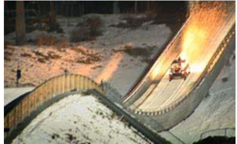
Mini Ski jump.

A recent newsletter from Trade Me indicates that amongst the top 15 site searches, the beloved Mini ranks at No. 4, slightly ahead of BMW at No. 6.