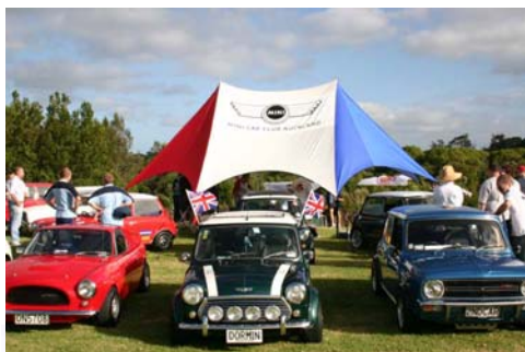
The eye catcher of the day.

Minis. Two on either side of the Marquee and one long one in front of it. There were so many Minis that the Show'n Shine judging took well over three hours.