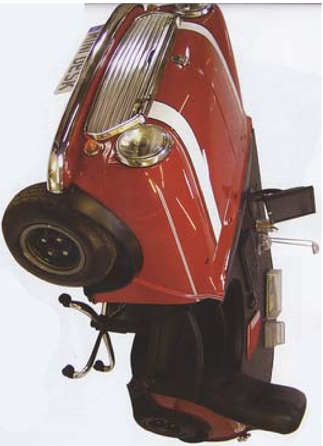
The ultimate desk.