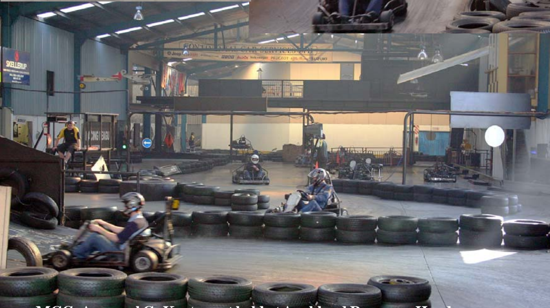
MCCoA annual GoKart event held at Auckland Raceway, Henderson.