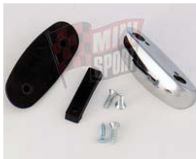
Plinth kit – TEXM99987 GB 7 pounds each.