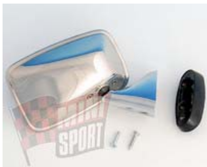
Mirrors – left hand GAM216A, right hand GAM215A, GB 13 pounds each.