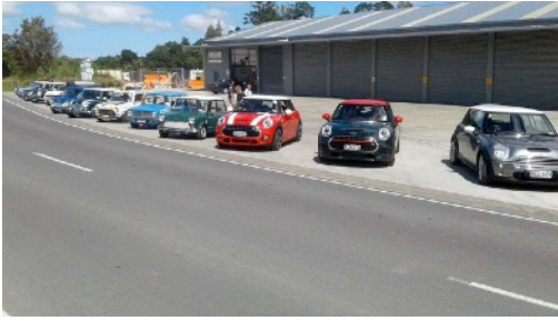
Downers Yard at Wainui.